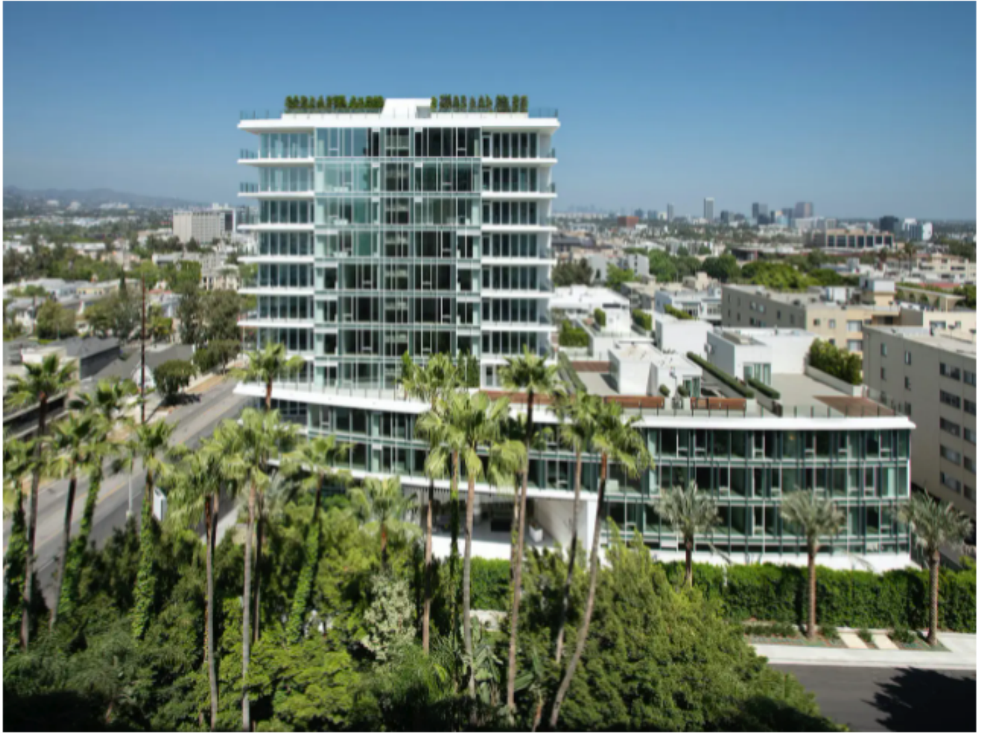
Four Seasons Private Residences Los Angeles. Peter Vitale