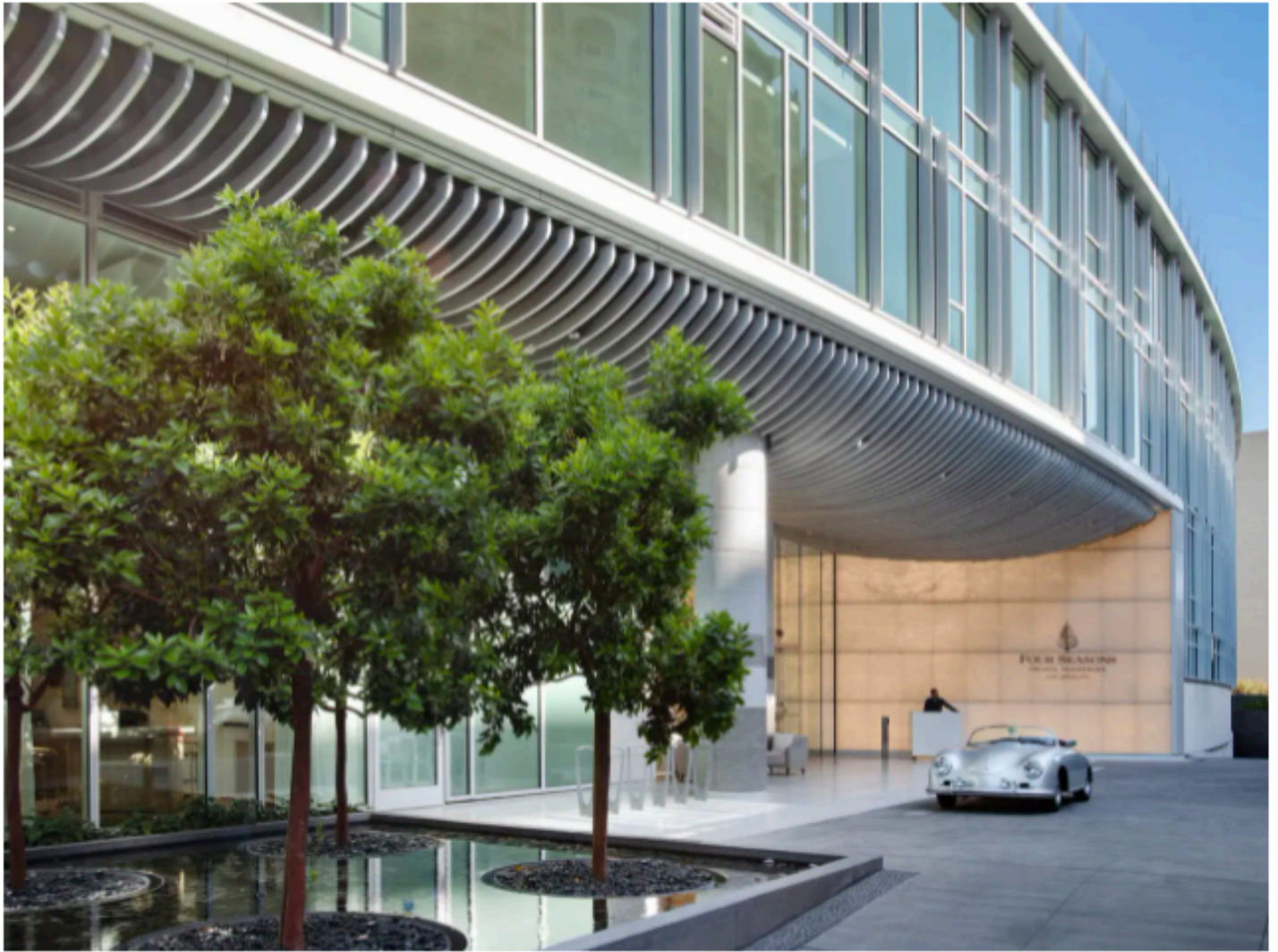
The entry of the Four Seasons Private Residences Los Angeles. Peter Vitale

If this kind of Four Seasons residential luxury sounds appealing to you, get ready to cough up a few million dollars.