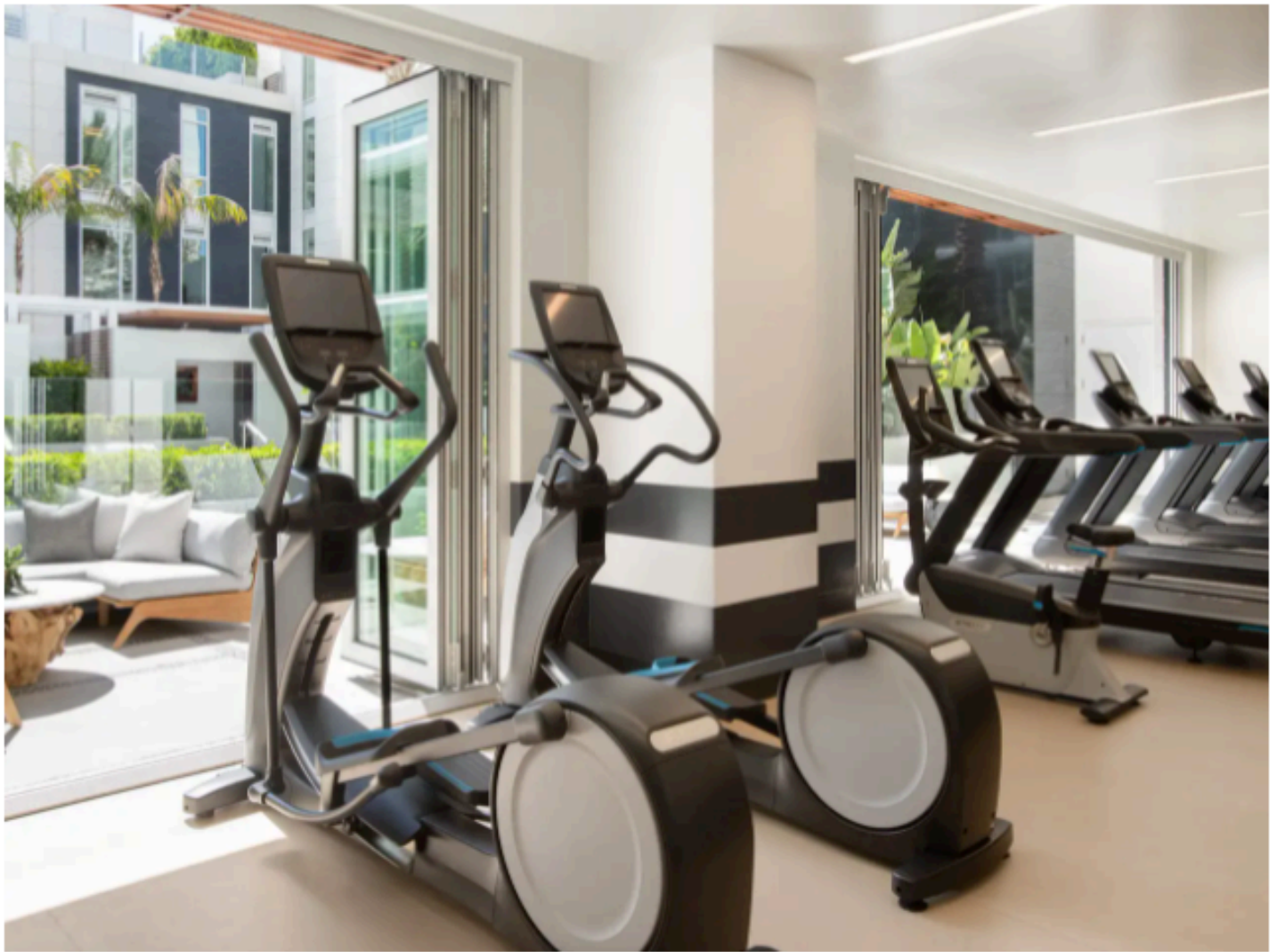
The gym inside the Four Seasons Private Residences Los Angeles.