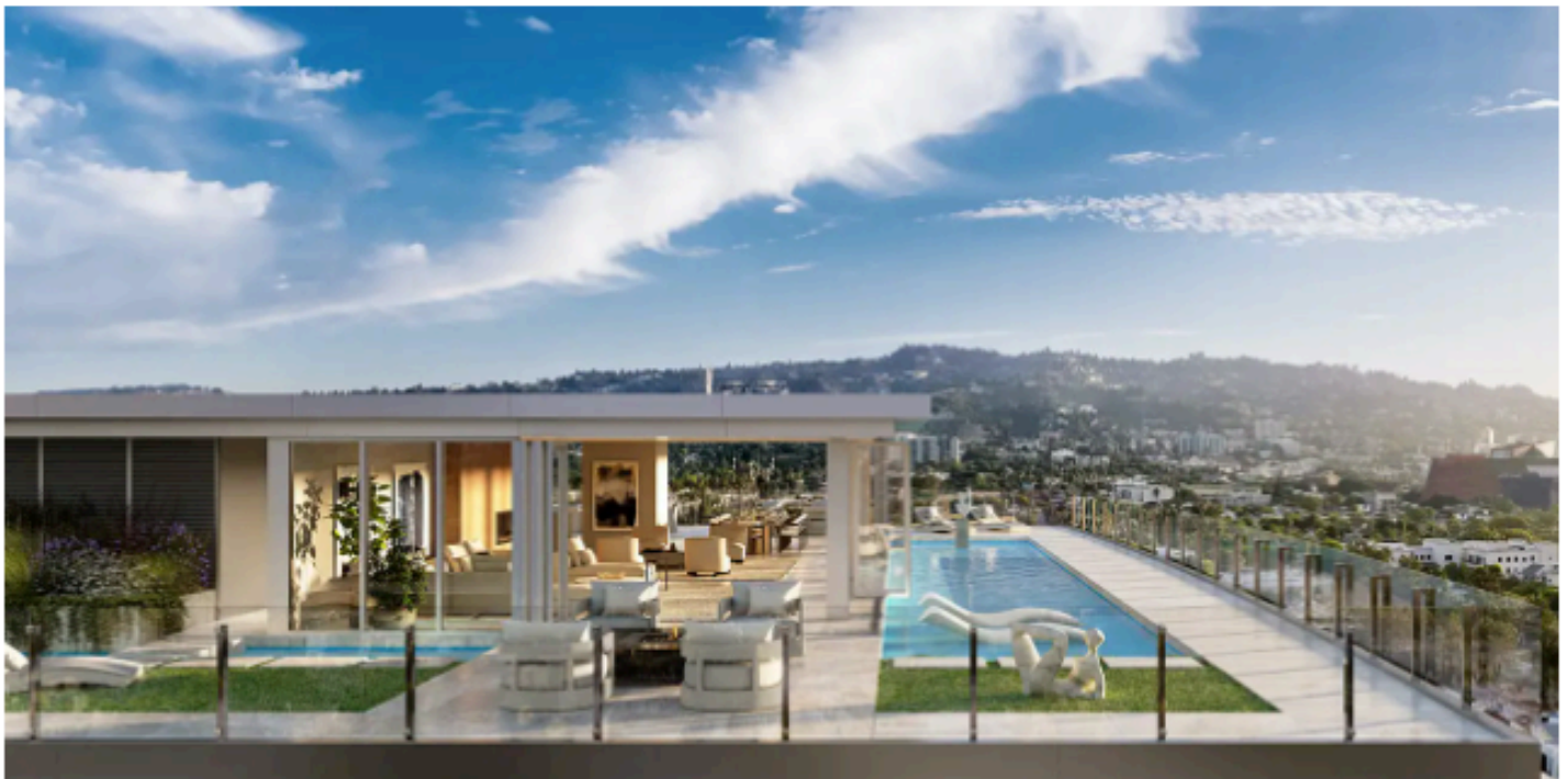
Four Seasons Private Residences Los Angeles' One LA's pool garden. Peter Vitale

The "blank canvas" open concept condo spans across the top two floors of the building and is lined with a large terrace for outdoor entertaining.