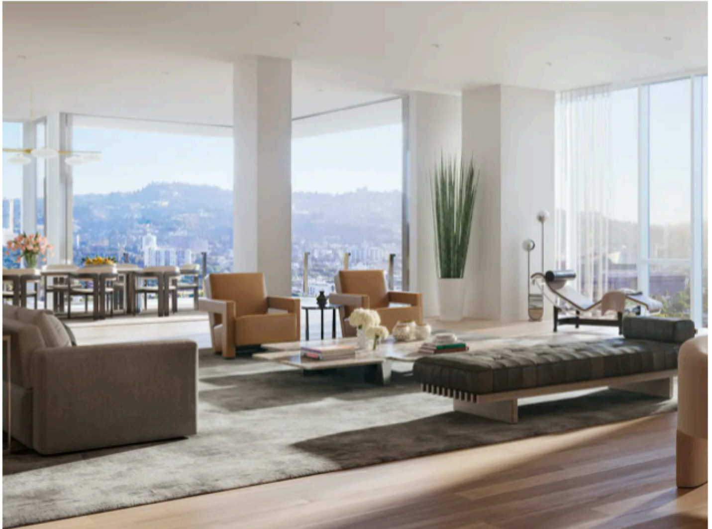
Four Seasons Private Residences Los Angeles' One LA's living room. Binyan Studios

And its sliding glass doors give way to an indoor-outdoor living space with 360-degree views of Los Angeles.