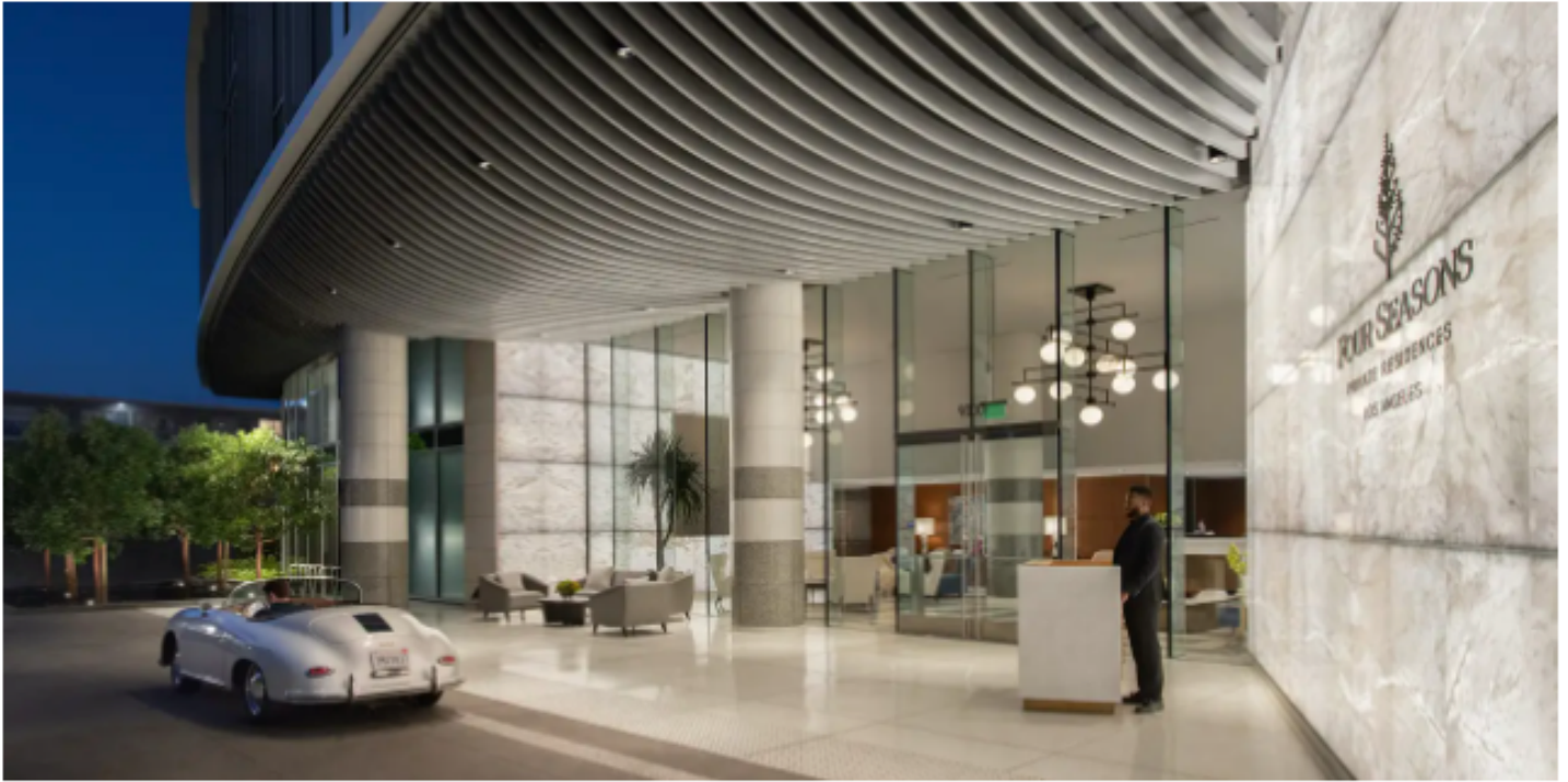
The entrance of the Four Seasons Private Residences Los Angeles

A new Los Angeles penthouse was unveiled on Monday, and if it sells at its $75 million asking price, the 13,000-square-foot home will be the city's most expensive condo, according to the company behind the penthouse: Four Seasons.