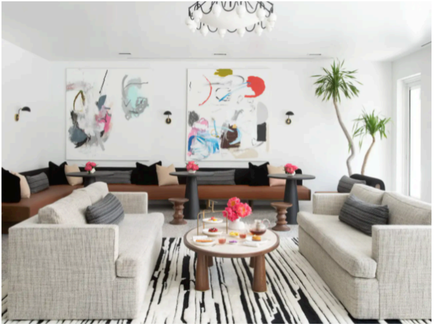
The residence lounge inside the Four Seasons Private Residences Los Angeles. Peter Vitale