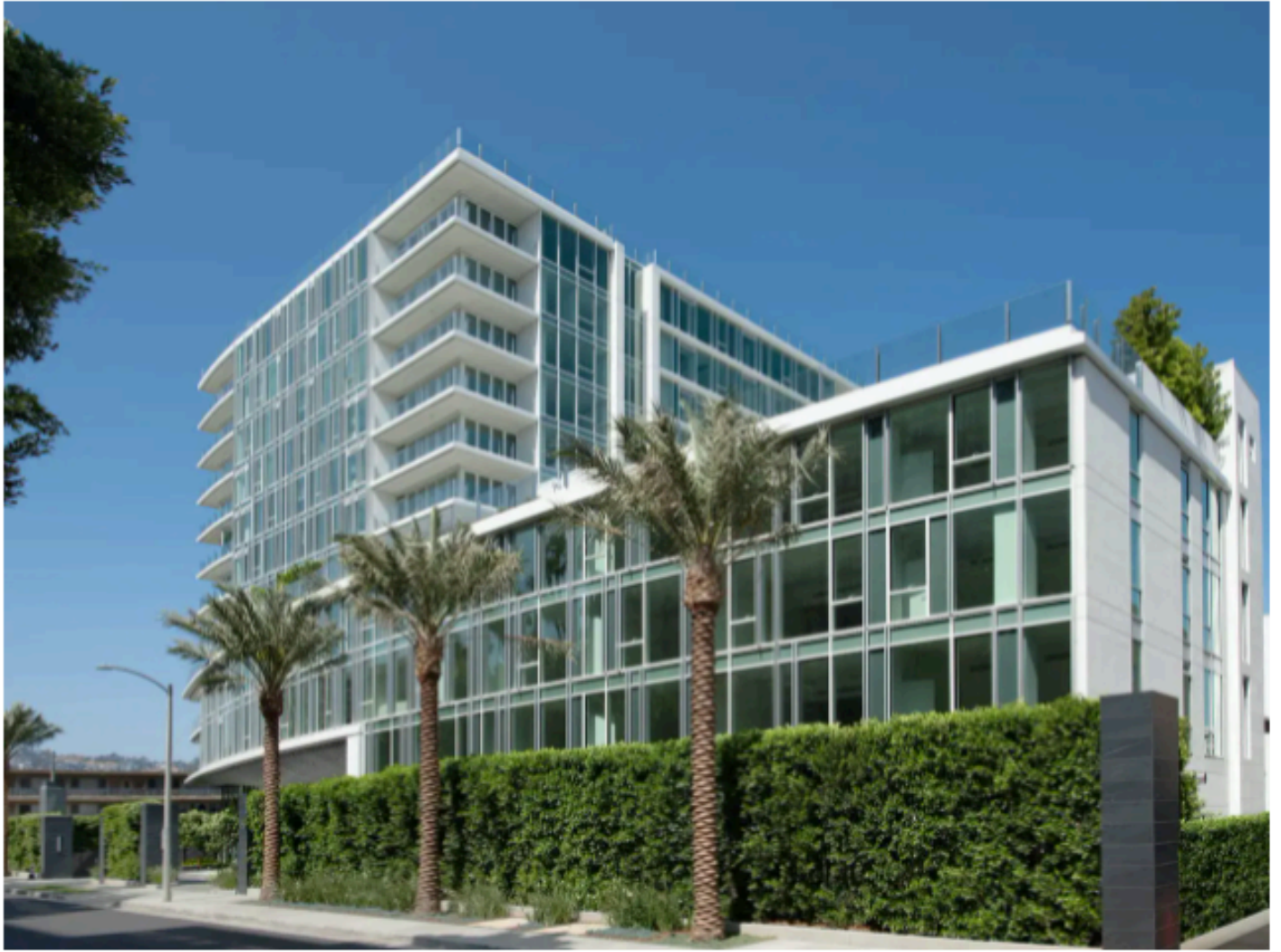
Four Seasons Private Residences Los Angeles. Peter Vitale

Luckily, the "paparazzi-proof" Four Seasons Private Residences Los Angeles has valet parking, underground parking with direct access to the condos, and private garages, according to the Wall Street Journal.