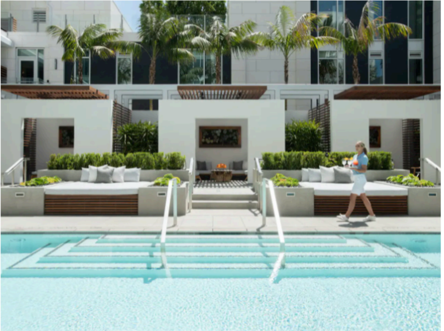
The pool at the Four Seasons Private Residences Los Angeles.