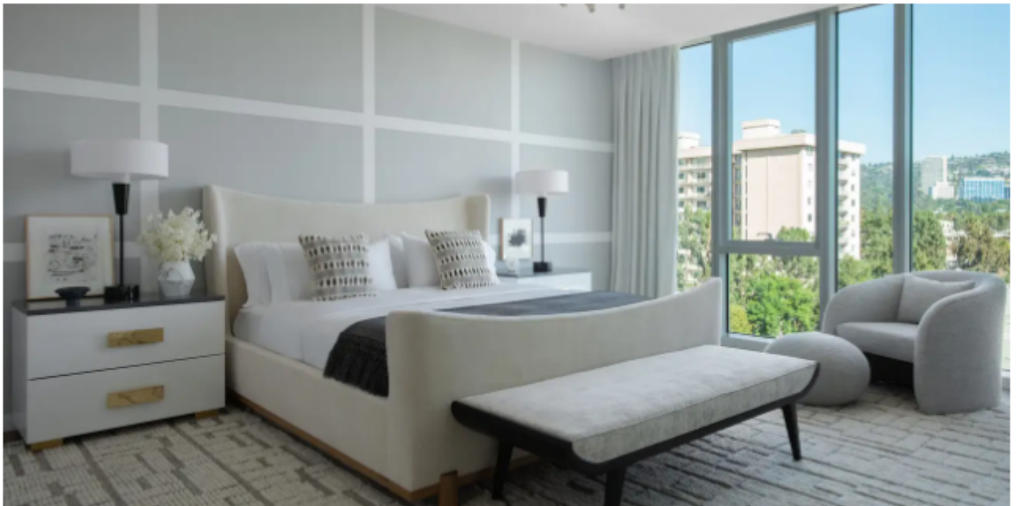
A bedroom inside the Four Seasons Private Residences Los Angeles. Peter Vitale

... with luxury amenities like gourmet kitchens, marble dual vanities in the primary bathrooms, and soaking tubs.