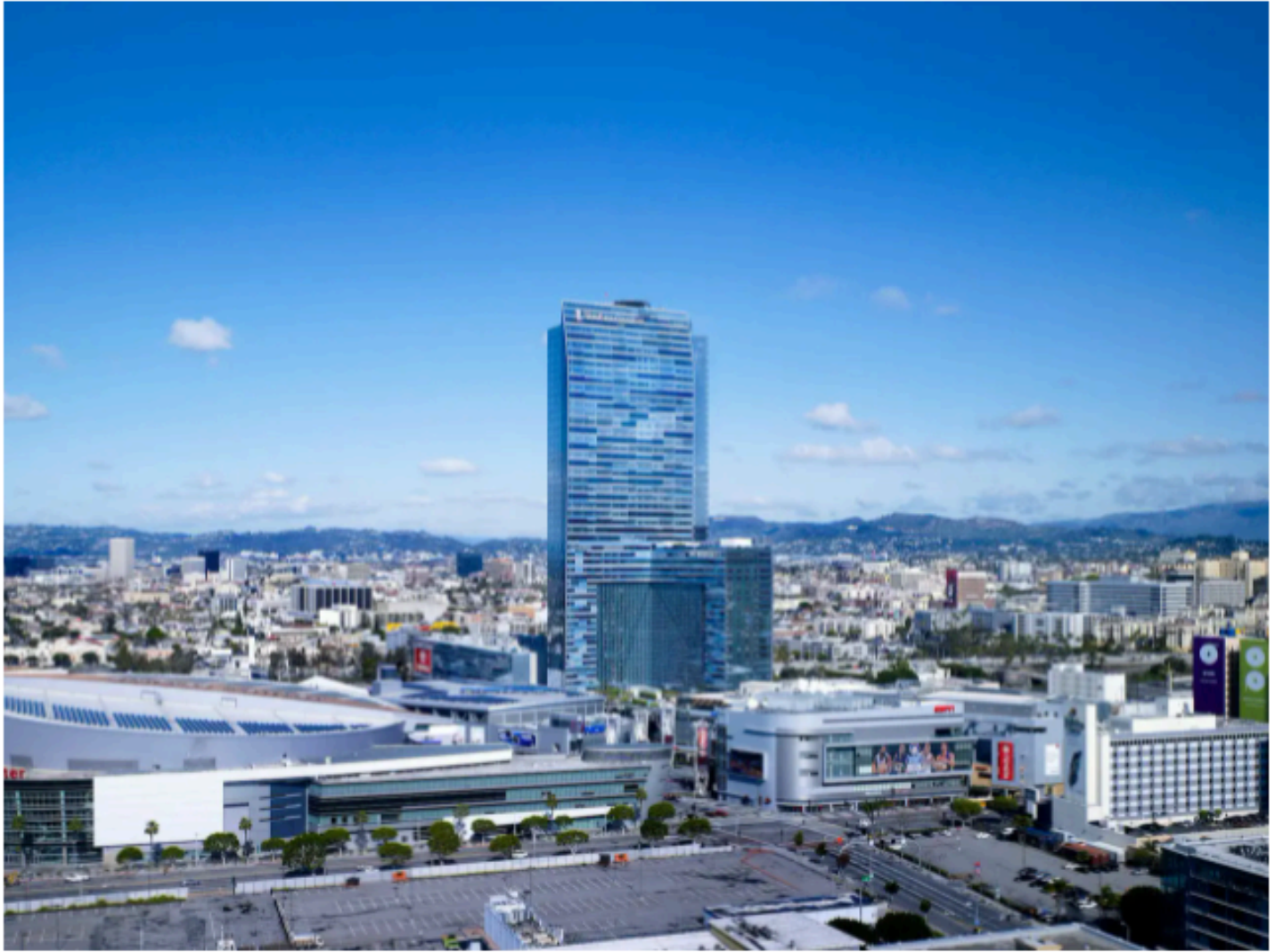
The Ritz-Carlton Tower.

And if you opt to live in Four Seasons' Beverly Hills condos, you'll have another hotel-branded neighbor.