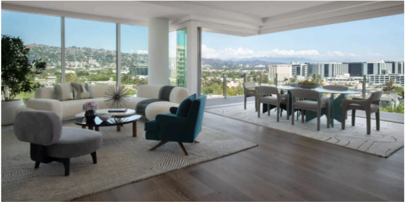
A living room inside the Four Seasons Private Residences Los Angeles.

The "blank canvas" open concept condo spans across the top two floors of the building and is lined with a large terrace for outdoor entertaining.